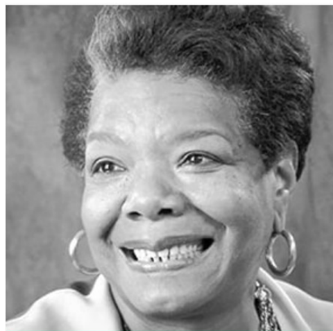
Maya Angelou 1928 – 2014