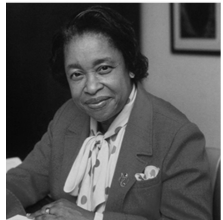
Margaret Walker 1915 – 1998

Amos is a Shepherd of suffering sheep; A pastor preaching in the depths of Alabama Preaching social justice to the Southland Preaching to the poor a new gospel of love With the words of a god and the dreams of a man Amos is our loving Shepherd of the sheep Crying out to the stricken land “You have sold the righteous for silver And the poor for a pair of shoes. My God is a mighty avenger And He shall come with His rod in His hand.” Preaching to the persecuted and the disinherited millions Preaching love and justice to the solid southern land Amos is a Prophet with a vision of brotherly love With a vision and a dream of the red hills of Georgia “When Justice shall roll down like water And righteousness like a mighty stream.” Amos is our Shepherd standing in the Shadow of our God Tending his flocks all over the hills of Albany And the seething streets of Selma and of bitter Birmingham.